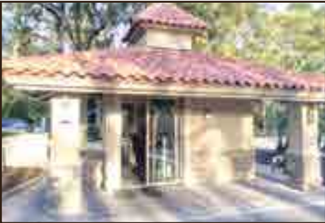
Solana Gatehouse after

Thank you for your understanding and notifying all your employees, service personnel and contractors. We look forward to another successful tournament.